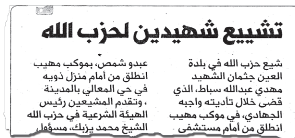
Al-Balad announcement of the funeral of two Hezbollah shaheeds.