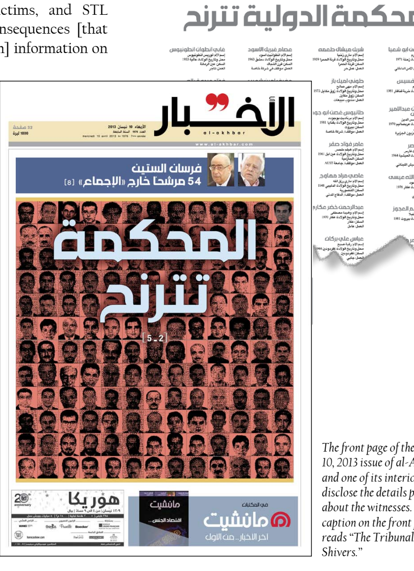
The front page of the April 10, 2013 issue of al-Akhbar and one of its interior pages disclose the details published about the witnesses. The caption on the front page reads "The Tribunal Shivers."

the site appears again is immaterial, as its prompt disappearance demonstrated that it was likely intended as a "blitzkrieg" operation to intimidate anyone who considered collaborating with the court—an outcome it achieved immediately and effectively.